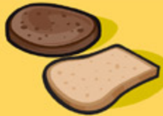
Bread 1 slice (35g)