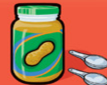
Peanut or nut butters 30 mL (2 Tbsp)